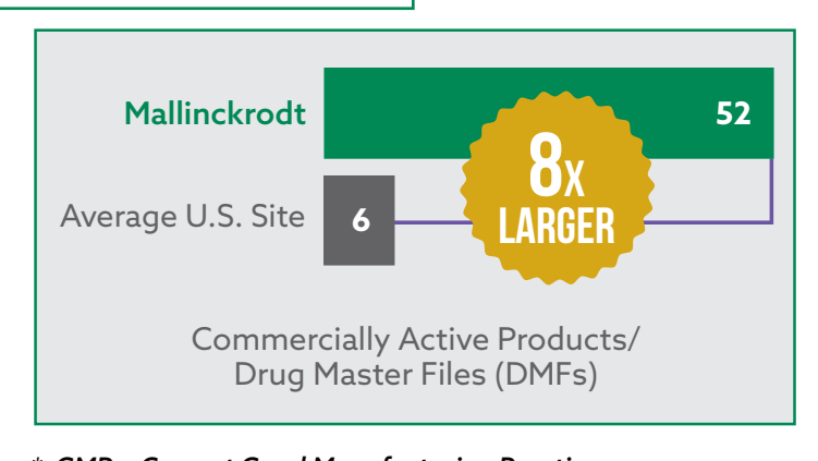
*cGMP = Current Good Manufacturing Practice